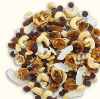
BANANA & CHOCOLATE