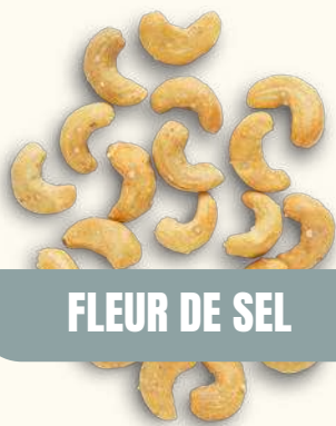
FLEUR DE SEL