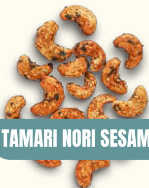
TAMARI NORI SESAME