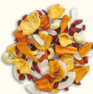
TROPICAL MIX (MANGOES)