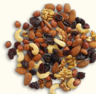
TRAIL MIX (CRANBERRIES)