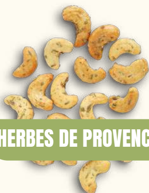
HERBES DE PROVENCE