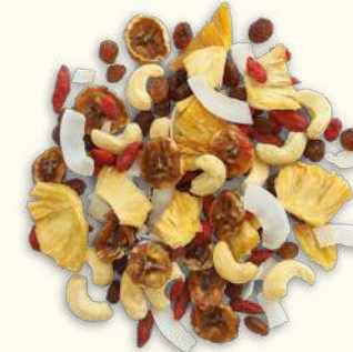
TROPICAL MIX (BANANA)