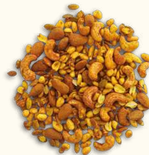
MIX TAMARI TURMERIC