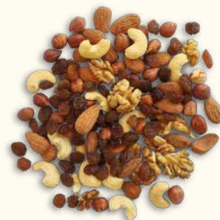
TRAIL MIX (CURRENTS)