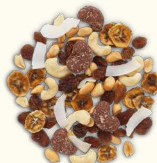
BANANA & CHOCOLATE